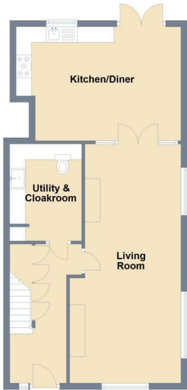
Ground Floor Approx. 61.0 sq. metres (656.7 sq. feet)